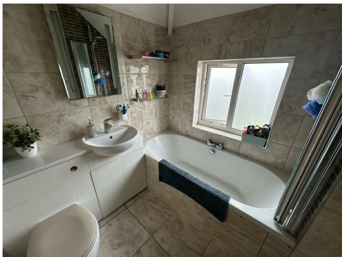
Bathroom 6'08 x 6'04 (2.03m x 1.93m)