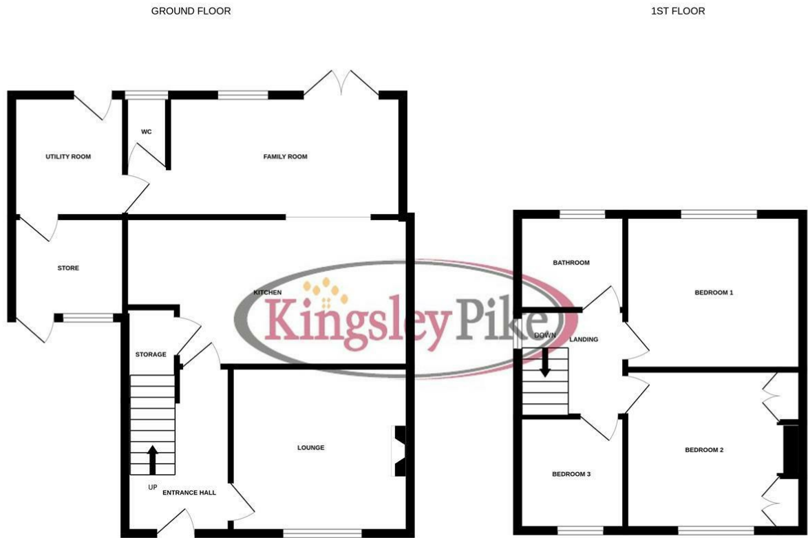
3 BEDROOM SEMI DETACHED HOUSE

Whilst every attempt has been made to ensure the accuracy of the floorplan contained here, measurements of doors, windows, rooms and any other items are approximate and no responsibility is taken for any error, omission or mis-statement. This plan is for illustrative purposes only and should be used as such by any prospective purchaser. The services, systems and appliances shown have not been tested and no guarantee as to their operability or efficiency can be given. Made with Metropix ©2026