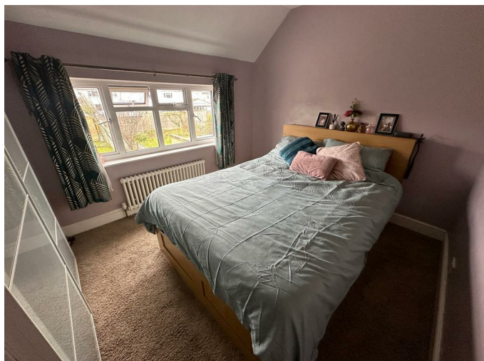
Bedroom One 12'01 x 9'10 (3.68m x 3.00m)