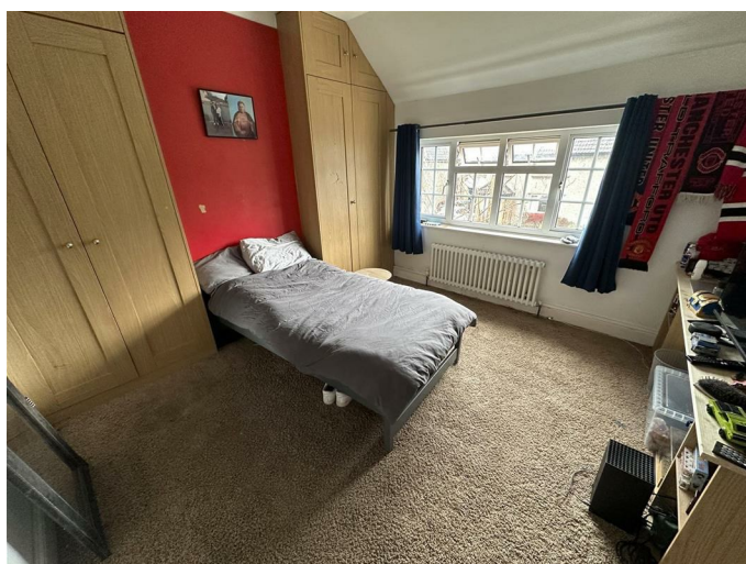
Bedroom Two 11' x 10'11 (3.35m x 3.33m)